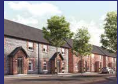
THIRTY EIGHT NORTH Belfast BT13 3WT