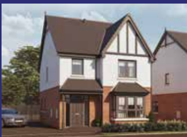
ASHDENE WOOD Dundonald BT16 1XS