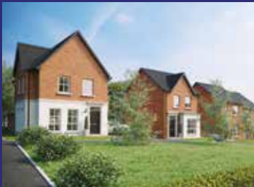
BALLYVEIGH Antrim BT41 2GW