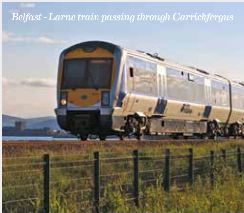
Belfast - Larne train passing through Carrickfergus