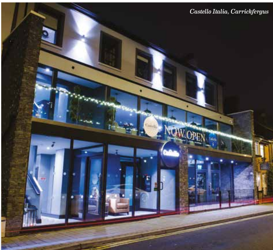
Castello Italia, Carrickfergus