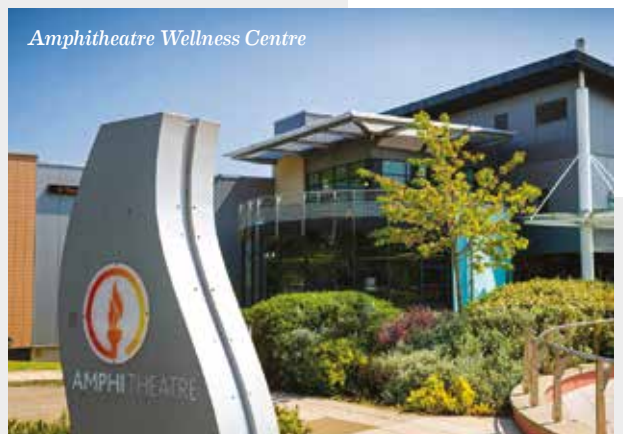
Amphitheatre Wellness Centre