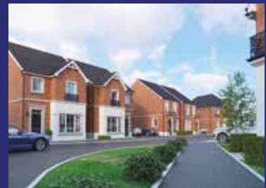
BALLYORAN HEIGHTS Dundonald BT16 1WG