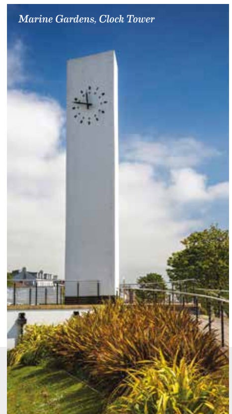
Marine Gardens, Clock Tower