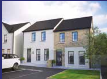
ENLER VILLAGE Comber BT23 5ZW