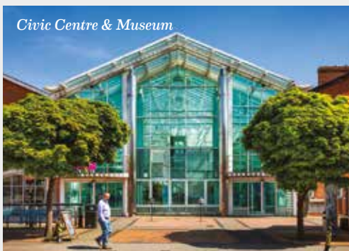
Civic Centre & Museum