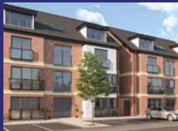
THIRTY THREE SOUTH South Belfast BT12 5JR