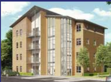
THE ROSE GARDEN Dunmurry BT17 9GY