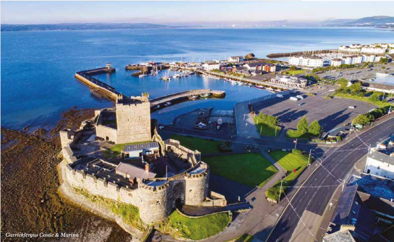
Carrickfergus Castle & Marina